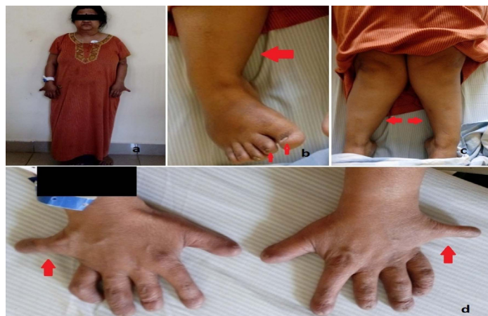
[Table/Fig-1]: a) Profile of the patient showing short stature; b) Poorly developed nails in the feet (small arrows), with mesomelia of the lower limbs (large arrow); c) Genu valgum and mesomelia of the lower limbs; d) Polydactyly, clinodactyly of the fifth digits (arrows), and poorly developed nails in the hands bilaterally.

Cardiovascular examination revealed a long narrow thorax, grade 3/6 short systolic murmur at the left lower sternal border and a loud second heart sound. Rest of the cardiovascular examination was unremarkable.